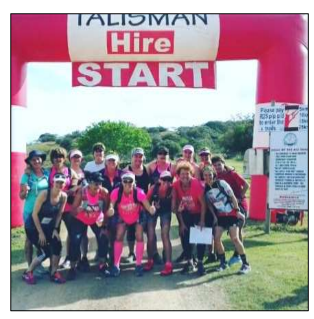
African Angels Ale Trail sponsored by Talisman Hire East London