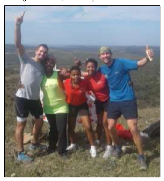
The African Angels Selfie spot at the top of the Chefani River was as popular as ever.