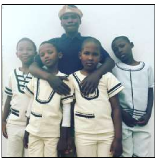
African Angels - growing good men

The learners were invited to participate in Heritage Day at school this year and come in traditional outfits. We want our learners to be proud of their Xhosa heritage and take this day to celebrate it.