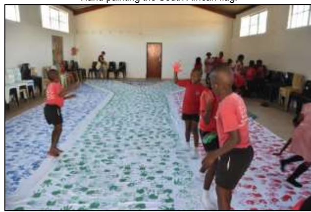
The huge flag created by learners and the Mercedes Benz South Africa team.

Mandela Day 2018 saw a huge team from Mercedes Benz South Africa arrive at African Angels. The MBSA team helped with the round robin of games that each class was participating in, and were instrumental in the creation of a hall sized, hand painted, South African flag. We would like to thank every MBSA team member who came and gave up their day to spend with our children.